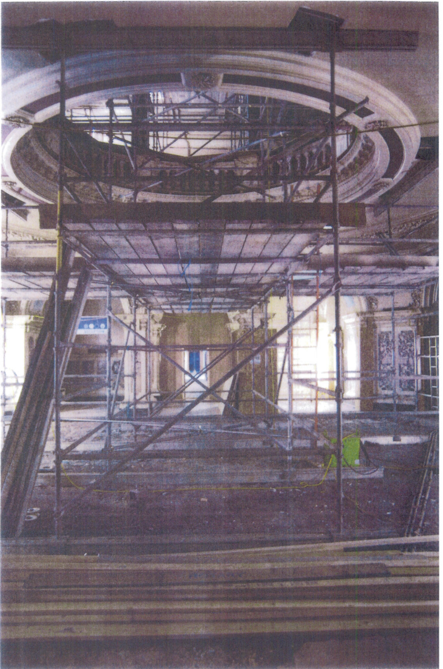
Reception - looking across towards reception desk