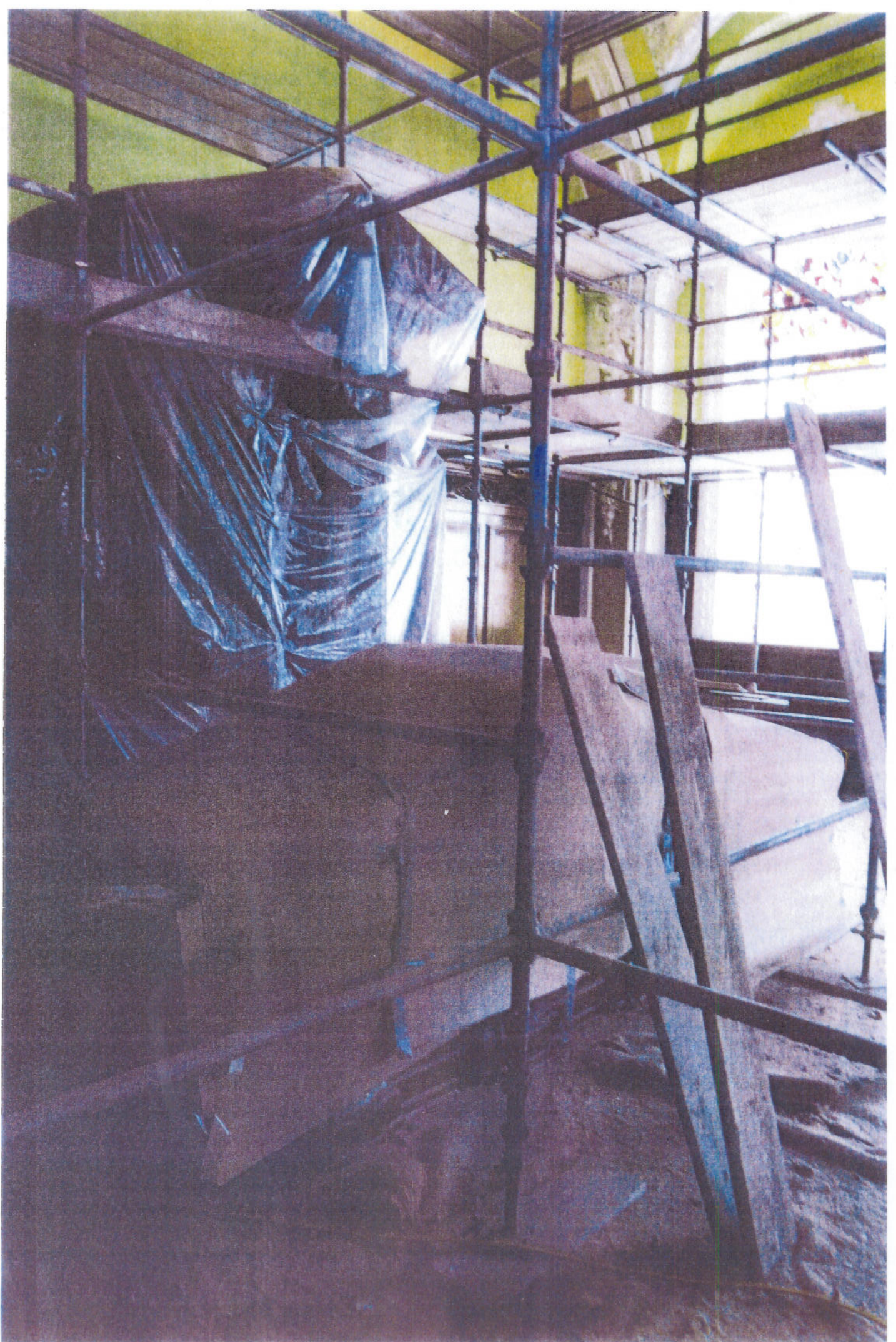
Council Chamber - Lord Mayor's Chair